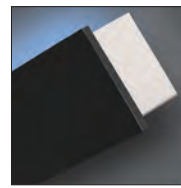
Panel color (Black)

Mounting brackets are equipped with sliding and side bracket as standard