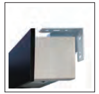
Side bracket (130° ~ 150° are case integrated type) 1set:2 pairs