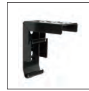
Sliding bracket (Except 130° ~ 150°) 1set:2 pairs