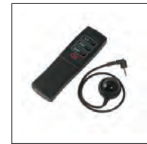
Infrared wireless remote controller