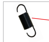
Flexible springs are easily installed