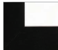
Flocky processed frame surface