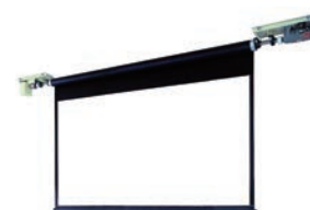
Large size projection screen