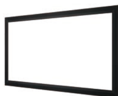
Fixed frame projection screen