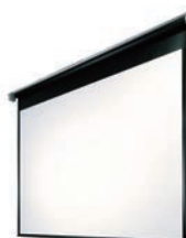
Large size projection screen