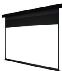
P-selection / Electric projection screen