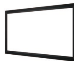
Fixed frame projection screen