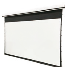
Tab tension projection screen