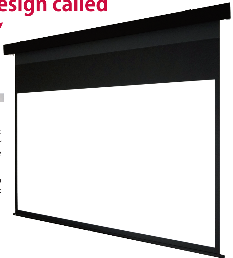
Black Panel EP